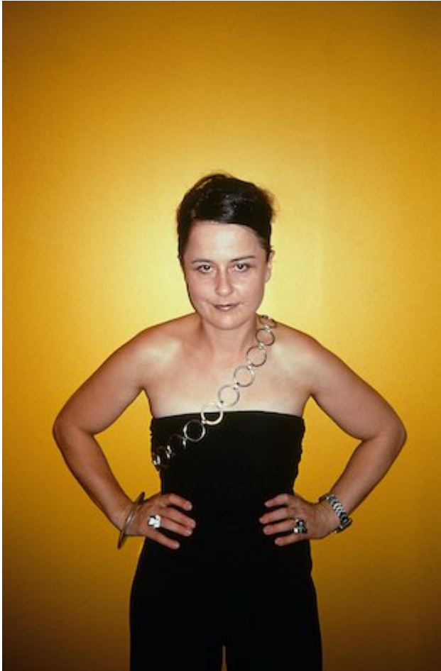
Ann Shelton, At home, K Road , 1995–2003, 33.5 x 28.4 x 45 cm, framed, edition of 6 + 2AP.